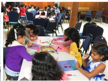
Retreats with the theme, "Journey of a Catholic," were held from October 27-29, 2017 at our church for both youth and young children.