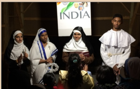
India's own saints St. Alphonsa, St. Teresa of Kolkata, St. Euphrasia and St. Kuriakose Elias