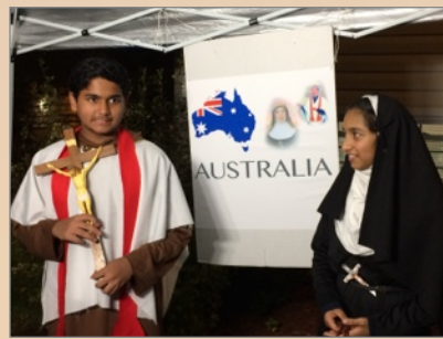
Two saints from Down Under

The Catholic Church has called for Halloween to be replaced with "Holyween", a night in which children would dress up like saints and attend prayer vigils and Masses.