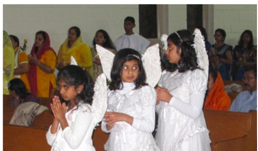
Children dressed as angels for the Holyween celebration on Halloween night