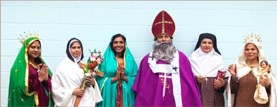
When some familiar faces transformed themselves into some very famous saints