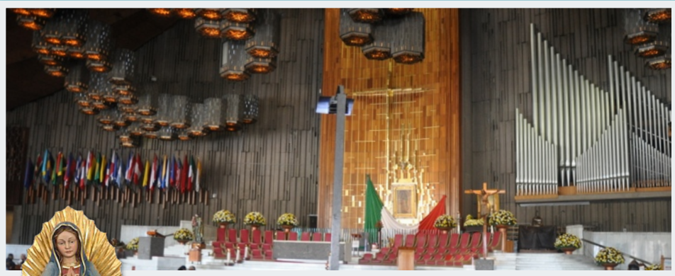
The magnificent altar at the new Basilica of Our Lady of Guadalupe (Basilica de Nuestra Señora de Guadalupe)

On December 9, 1531, a beautiful shining woman, the Virgin of Guadalupe, first appeared to Juan Diego, a humble Indian peasant, when he was crossing the hill of Tepeyac just north of present day Mexico City.