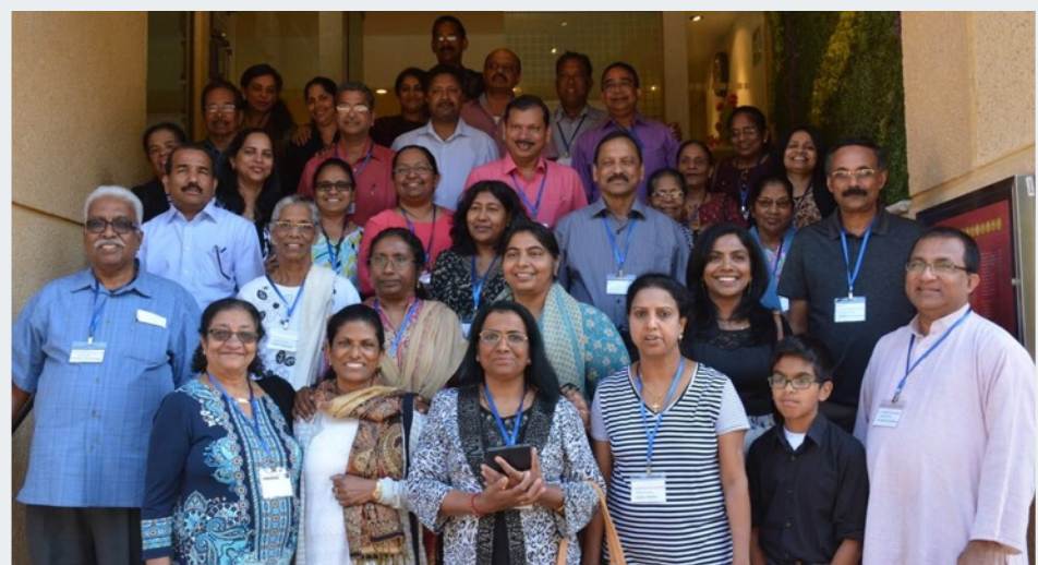
At Hotel Villa Quijotes, Guadalupe, close to the Basilica of Our Lady of Guadalupe