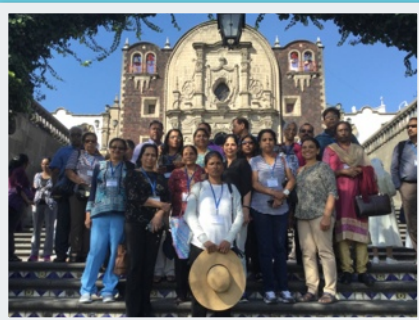
Basilica de Santa Maria de Guadalupe