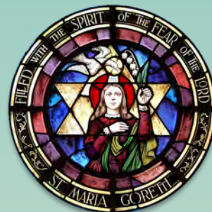
JULY 6 ST. MARIA GORETTI