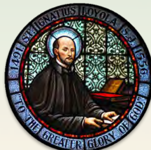
JULY 31 ST. IGNATIUS OF LOYOLA