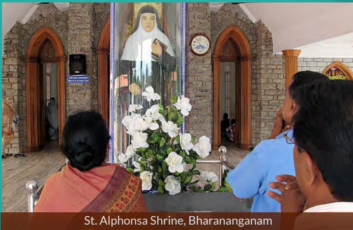
St. Alphonsa Shrine, Bharananganam

He had also written a poem on her titled "Suffering is God's Gift." St. Alphonsa accepted suffering with a smile. She knew that silence was the best ornament to wear at times of suffering and pain. Let us reassure ourselves like St. Alphonsa that "Nothing shall ever happen to us without the knowledge of Jesus."