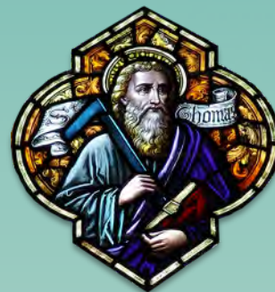
JULY 3 ST. THOMAS THE APOSTLE