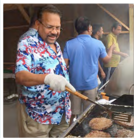
Flipping juicy burgers

As summer is here, the youth is also getting ready to compete in various sporting events. There is a soccer tournament happening June 29 th , where our youth will compete and represent our parish. We have also moved into phase two in the Year of Youth which focuses on building fellowship amongst the adults and youth within our parish. The picnic was a great way to start off this phase. More events for the youth are being planned as we approach the next phase of the Year of Youth, so be sure to keep your eyes and ears open for future events at our parish!