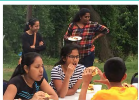
Enjoying sumptuous food

"Let your light shine before people, so that they will see the good things you do and praise your father in heaven."