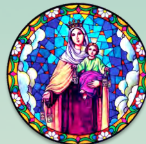
JULY 16 OUR LADY OF MT. CARMEL