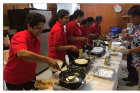
Making delicious masala dosas