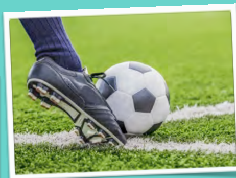
And it's about time to play competently. Soccer Tournament on June 29, 2017