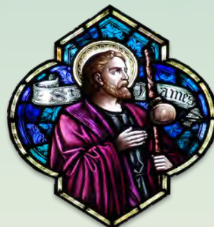
JULY 25 ST. JAMES THE APOSTLE