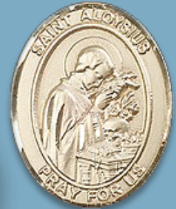
JUNE 21 ST. ALOYSIUS