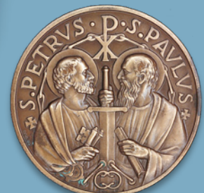
JUNE 29 ST. PETER & ST. PAUL