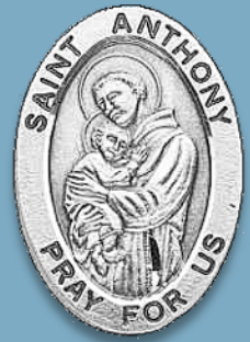
JUNE 13 ST. ANTHONY