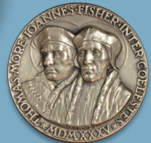
JUNE 22 ST. THOMAS MORE ST. JOHN FISHER