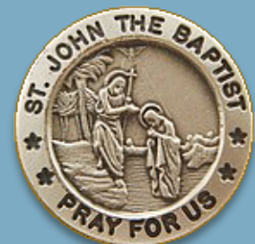
JUNE 24 ST. JOHN THE BAPTIST