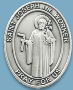
MAY 1 ST. JOSEPH THE WORKER