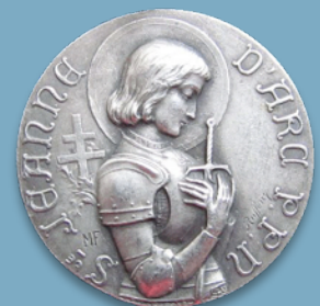
MAY 30 ST. JOAN OF ARC