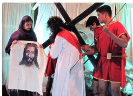
The Stations of the Cross on Good Friday