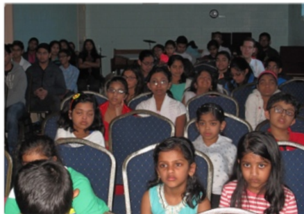
Youth Lenten Retreat

For the month of March, the Youth of the parish led a special Lenten Retreat: "The Way, The Truth, and The Life" for the younger children of the parish. There were three tracks for each age group respectively: Middle School, Elementary School, and Little Angels. Youth Coordinators, along with the assistance of High schoolers, College students, and young adults led sessions based on: "To Know, Love, and Serve God" over the course of two days. Each day began with the rosary, Praise & Worship, a skit introducing the theme of each day preceding each session, and the theme was reinforced during each session, with confession and adoration available for the duration of the retreat. Topics for sessions for the Lenten Retreat included: "How to recognize God's love in your daily life," "How to personally pray," "The 10 Commandments," and a special session on doing community service.