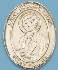
MAY 6 ST. DOMINIC SAVIO