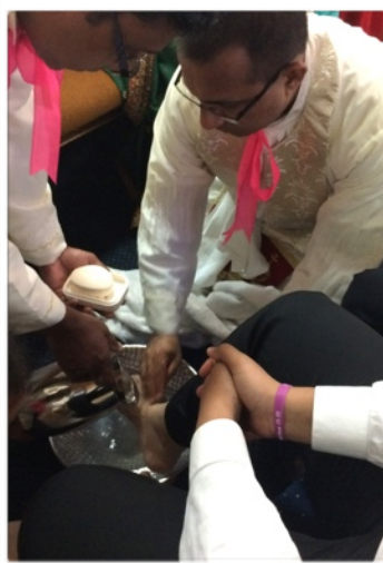
Holy Thursday | Washing of the feet