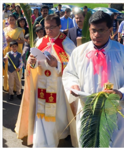
Palm Sunday | Procession