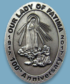
MAY 13 OUR LADY OF FATIMA