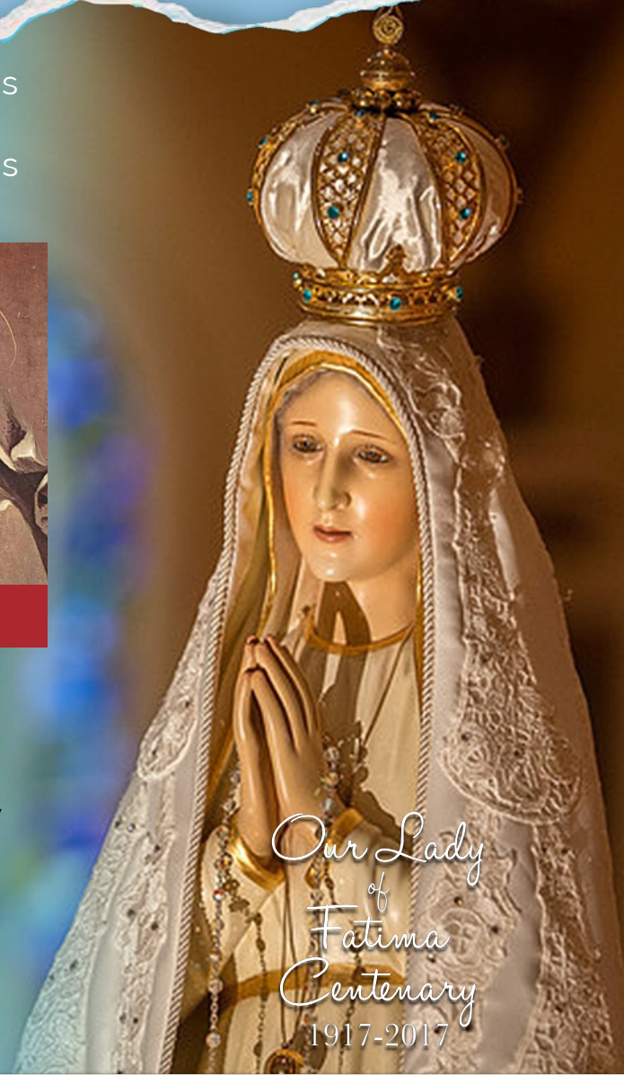
Our Lady of Fatima Centenary 1917-2017

The ascension of the Savior is an integral part of the proposition that Christ is the "Lord," who has the right to exercise "all authority in heaven and on earth." (Matthew 28:18) On Pentecost, after arguing for the resurrection and ascension, Peter contended: "Let all the house of Israel therefore know assuredly, that God has made him both Lord and Christ, this Jesus whom you crucified." (Acts 2:36)