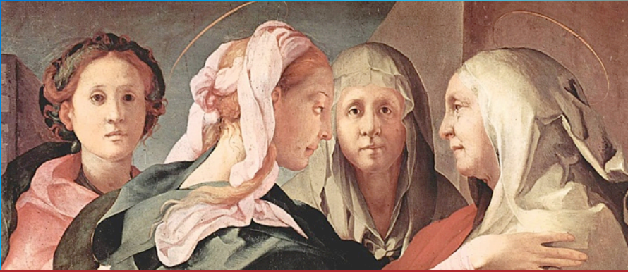
The Visitation of Mary

"My soul glorifies the Lord and my spirit rejoices in God my Savior, for he has been mindful of the humble state of his servant. From now on all generations will call me blessed, for the Mighty One has done great things for me – holy is his name." (Luke 1:46-49)