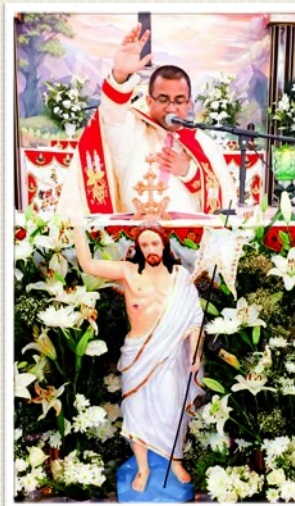
Easter Vigil | Holy Mass