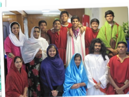
The cast of The Stations of the Cross