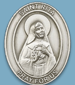
MAY 22 ST. RITA