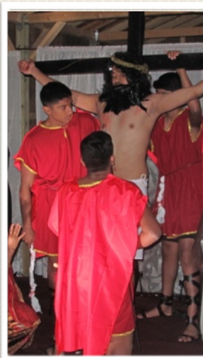
Good Friday | Crucifixion