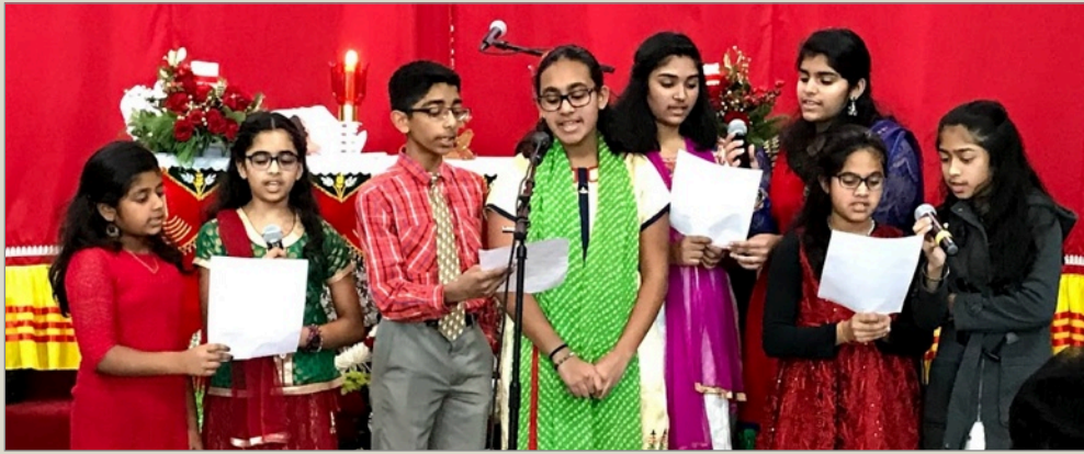
The Angel Voice Choir