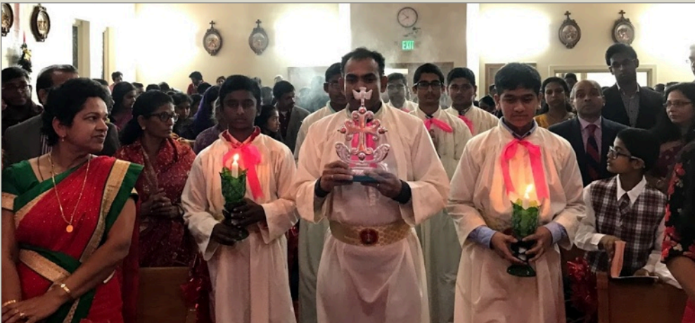
The Christmas celebrations began with the Solemn Holy Mass in Malayalam