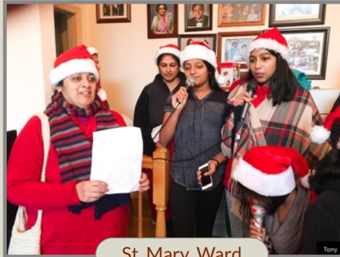
St. Mary Ward

Caroling, caroling now we go Christmas bells are ringing Caroling, caroling through the snow Christmas bells are ringing Joyous voices sweet and clear Sing the sad of heart to cheer Ding, dong, ding, dong Christmas bells are ringing ... Mark thee well the song that we sing Gladsome tidings now we bring Ding, dong, ding, dong Christmas bells are ringing.