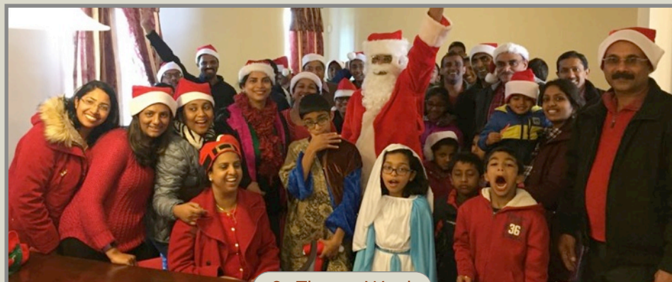
St. Thomas Ward