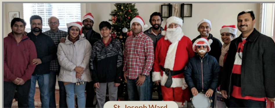
St. Joseph Ward

Caroling, caroling now we go Christmas bells are ringing Caroling, caroling through the snow Christmas bells are ringing Joyous voices sweet and clear Sing the sad of heart to cheer Ding, dong, ding, dong Christmas bells are ringing ... Mark thee well the song that we sing Gladsome tidings now we bring Ding, dong, ding, dong Christmas bells are ringing.