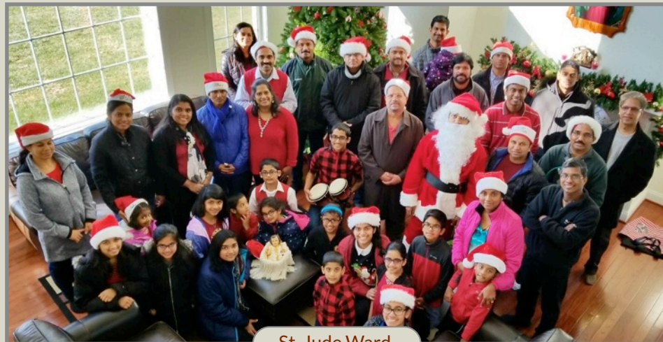
St. Jude Ward